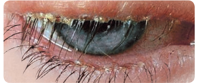
Sore, red, inflamed eyelids; crusty eyelashes

Sometimes, people will experience both types of Blepharitis because the causes are often connected.