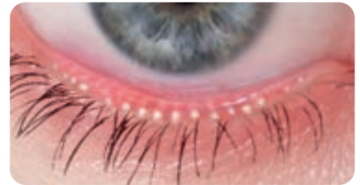
Blocked Meibomian glands